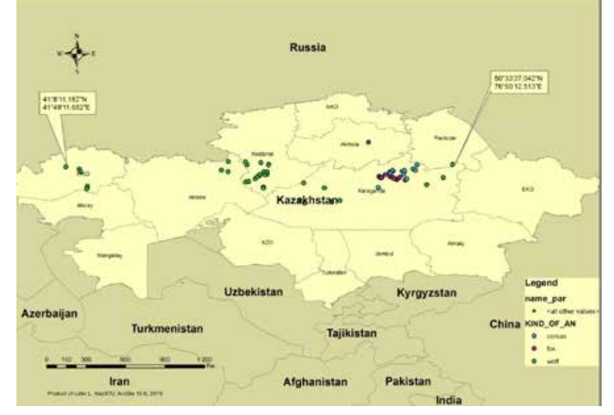
Figure 1. The specimens' study area

The intestines and associated organs of carcasses were removed after thawing overnight. The small and large parts of intestinal tract were opened, examined and investigated by the Skrjabin helminthological autopsy method (Ibrayev et al., 2017). All visible helminths were removed and examined microscopically. The intestinal sedimentation counting technique was used for the recovery of Echinococcus and other small helminths (Eckert et al., 2001). The abundance of helminths was counted in each animal and the parasite's genus and species were identified according to morphological features, using the manual for identification of hunting mammals' helminths. Before microscopy, nematodes and acanthocephalans were cleared in lactophenol (Yatusevich, 2010; Sepulveda and Kinsella, 2013). E. multilocularis was identified according to Eckert and Deplazes, 2004.